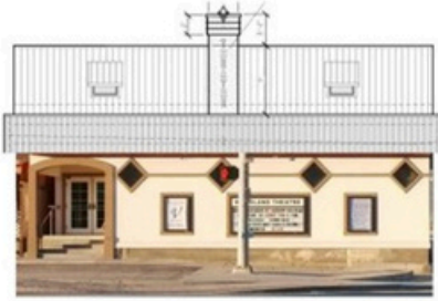
Front façade with the historic tower

Your donations will fund the new capital projects and help pay off the line of credit used to complete the backstage.